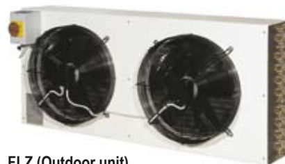
FLZ (Outdoor unit)

FL dehumidifiers series are high-performances units especially designed for industrial or commercial purposes where humidity level should be controlled or water vapour condensation should be prevented. These units are particularly indicated for archives, ironing rooms, bookstores, cheese factories, underground rooms, cellars and industrial sites where high humidity level is present. This series comprises 3 basic models which cover a capacity range from 564 to 940 l/24h. FL units are designed for easy maintenance and service, each part being readily accessible and, when required, easily replaceable thus reducing service and maintenance costs.